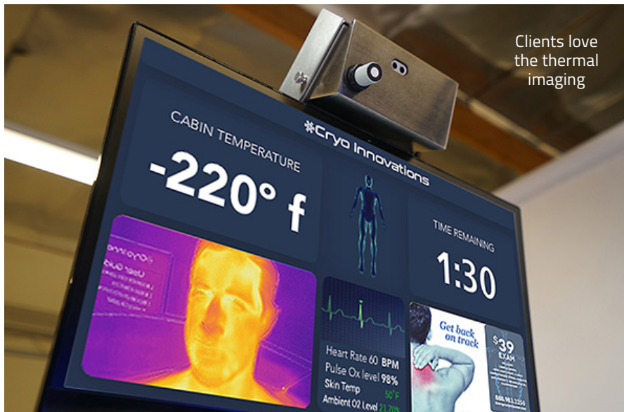
Clients love the thermal imaging